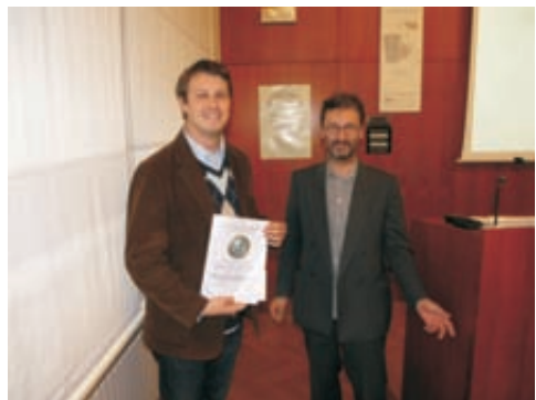
Ljudevit Jurak Award ceremony 2010